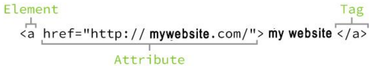
Fig 1 HTML syntax outline including an element, attribute, and tag

Now that you know what HTML elements, tags, and attributes are, let's take a look at putting together our first web page.